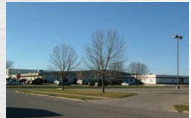
Food Service Equipment Facility Wisco Industries, Inc.