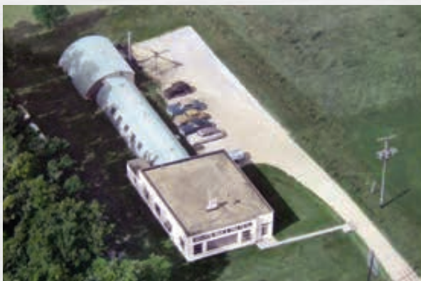
Wisconsin Mold and Tool Co., Inc. 1953

Expansion of sales and marketing efforts in both the Metal Stamping end of the business and the Food Equipment market has let to growth of the family owned and operated company that you see today.