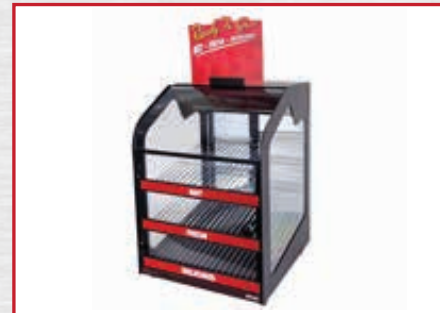
Model 891A Food Warming/ Merchandising Cabinet