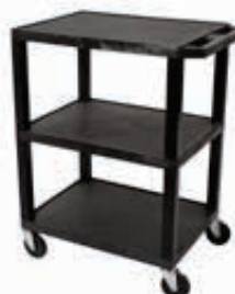
Model 220 Merchandising Cart