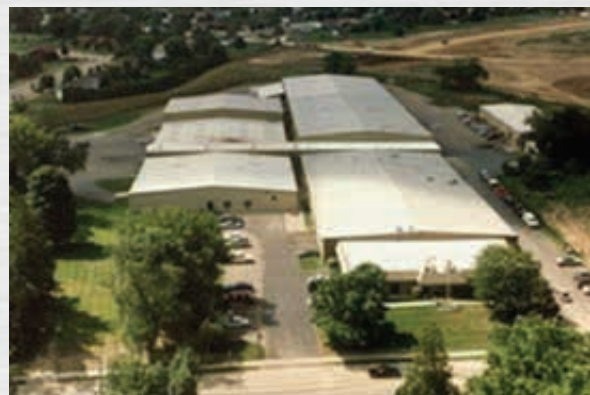
Metal Stamping & Fabrication Facility Wisco Industries, Inc.