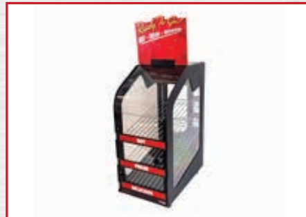
Model 791A Food Warming/ Merchandising Cabinet