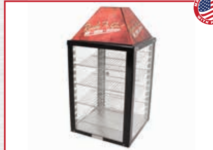
Models 690-25 Food Warming/ Merchandising Cabinet