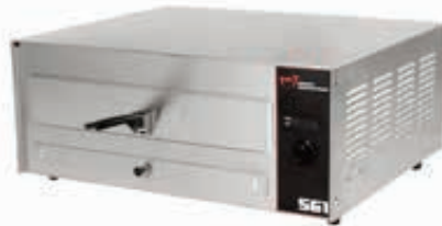
Model 561A Deluxe Pizza Oven