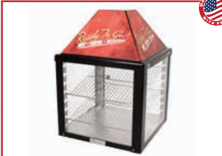
Models 690-16 Food Warming/ Merchandising Cabinet