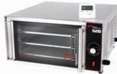
Model 520 Cookie Oven/Convection Oven