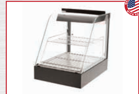
Model 323HH Food Warming/ Merchandising Cabinet