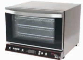
Model 621 1/4 Size Convection Oven