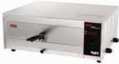
Model 421 Pizza/Multi-Purpose Oven