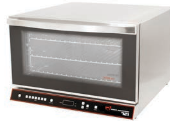
MODEL 721 1/2 SIZE CONVECTION OVEN