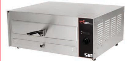
MODEL 561 DELUXE PIZZA OVEN