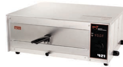
MODEL 421 PIZZA/MULTI-PURPOSE OVEN