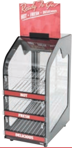
MODEL 791 FOOD WARMING/ MERCHANDISING CABINET