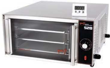
MODEL 520 COOKIE OVEN/ CONVECTION OVEN