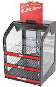
MODEL 891 FOOD WARMING/ MERCHANDISING CABINET