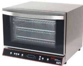
MODEL 621 1/4 SIZE CONVECTION OVEN