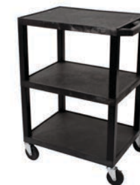
MODEL 220 MERCHANDISING CART